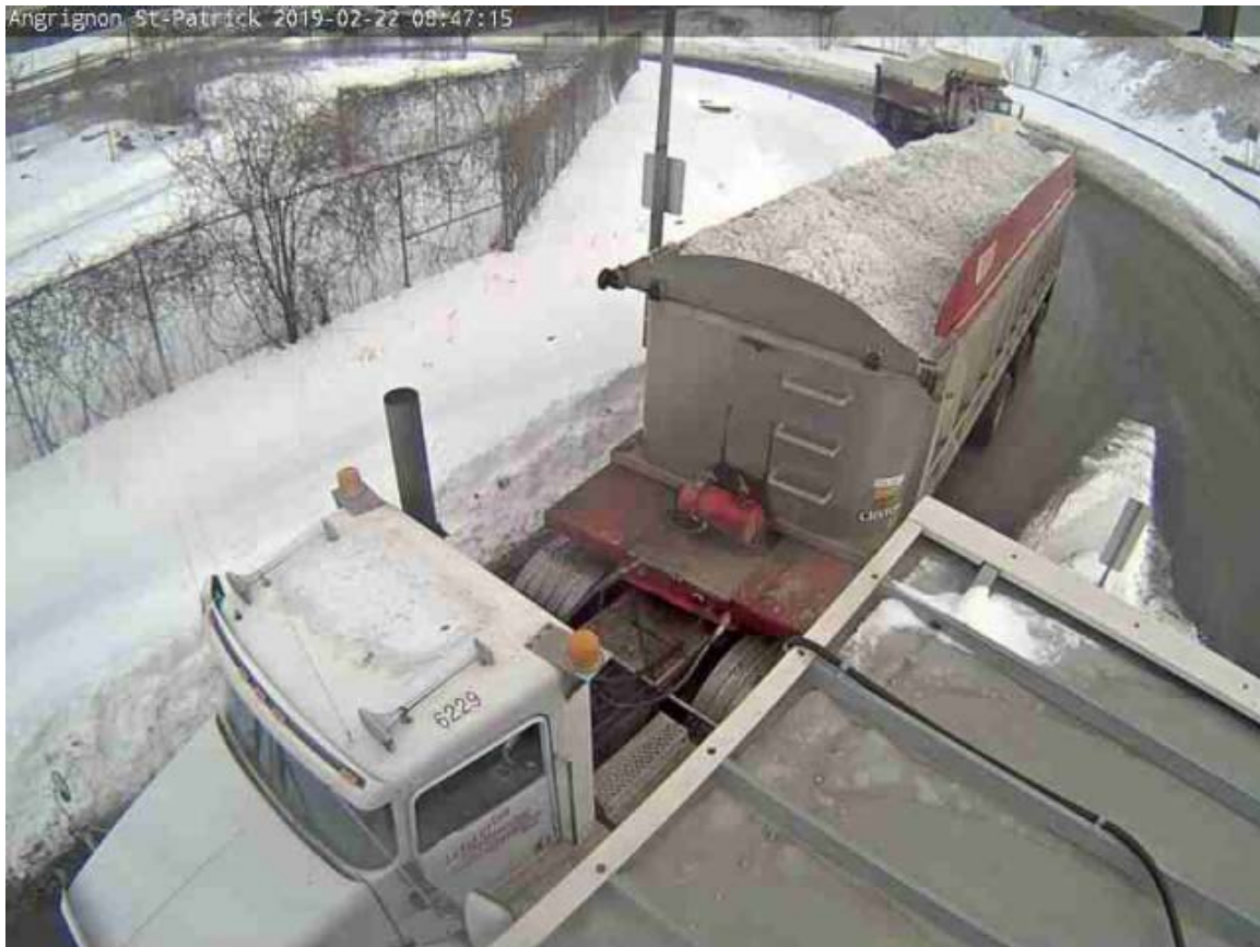
Transport of snow by Entreprise Sylvain Choquette inc. on February 22, 2019.