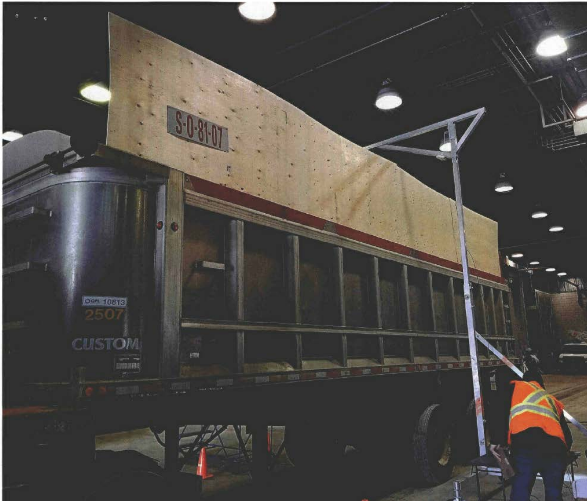
Photo taken from the outside of the Entreprise Sylvain Choquette inc. truck bin during the March 9, 2019, measuring session.