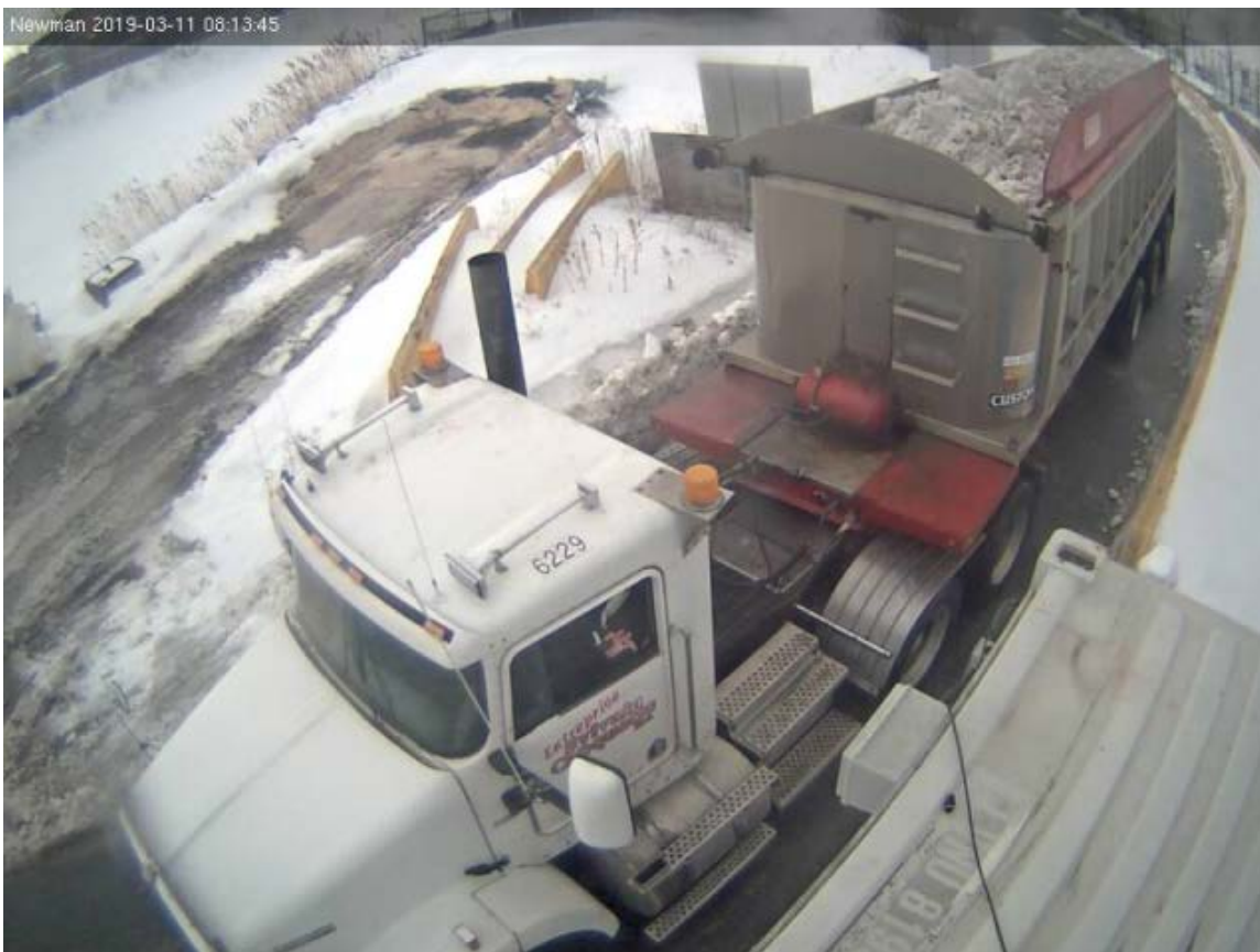
Transport of snow by Entreprise Sylvain Choquette inc. on March 11, 2019.