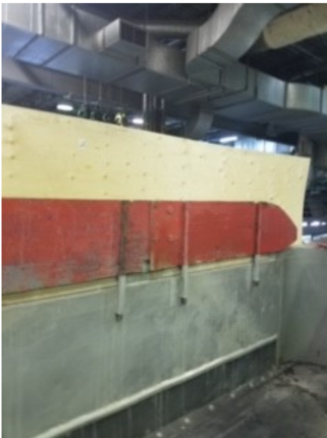
Photo taken from the inside of the Entreprise Sylvain Choquette inc. truck bin during the March 9, 2019, measuring session.