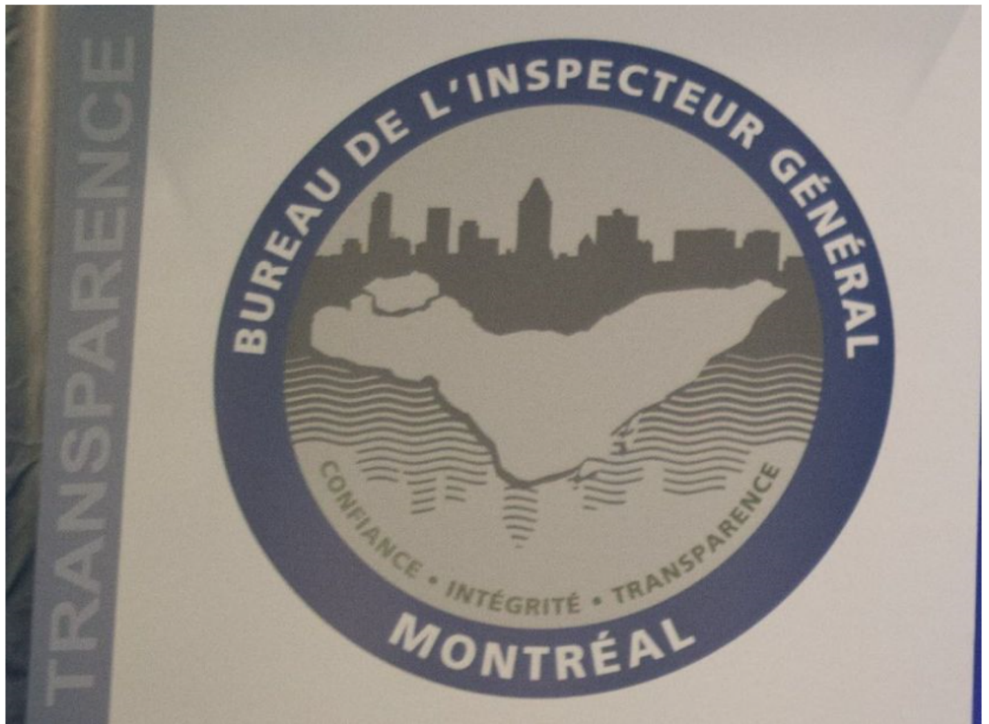
The city of Montreal's inspector general's office.